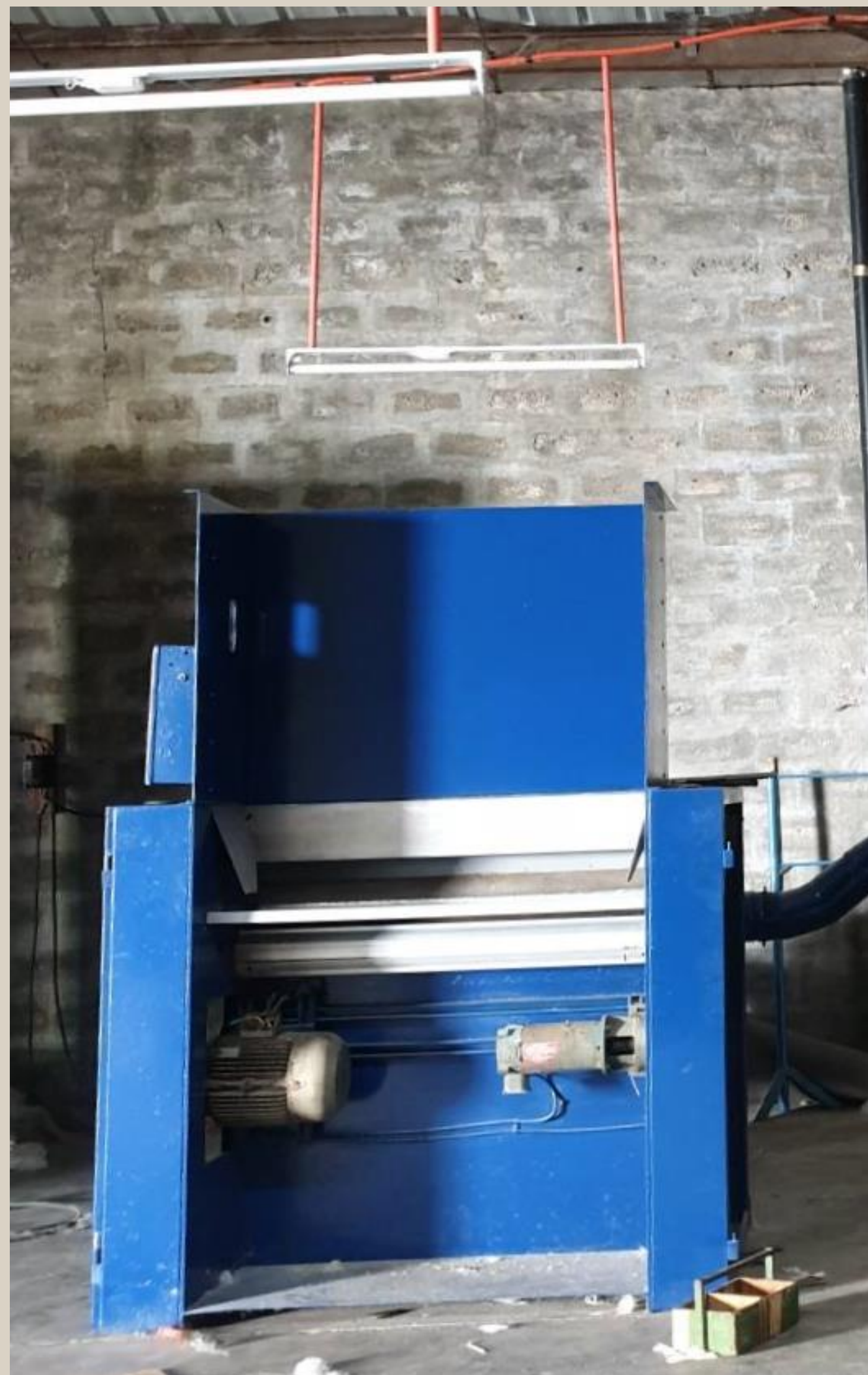
p. 11 Fiber Opener