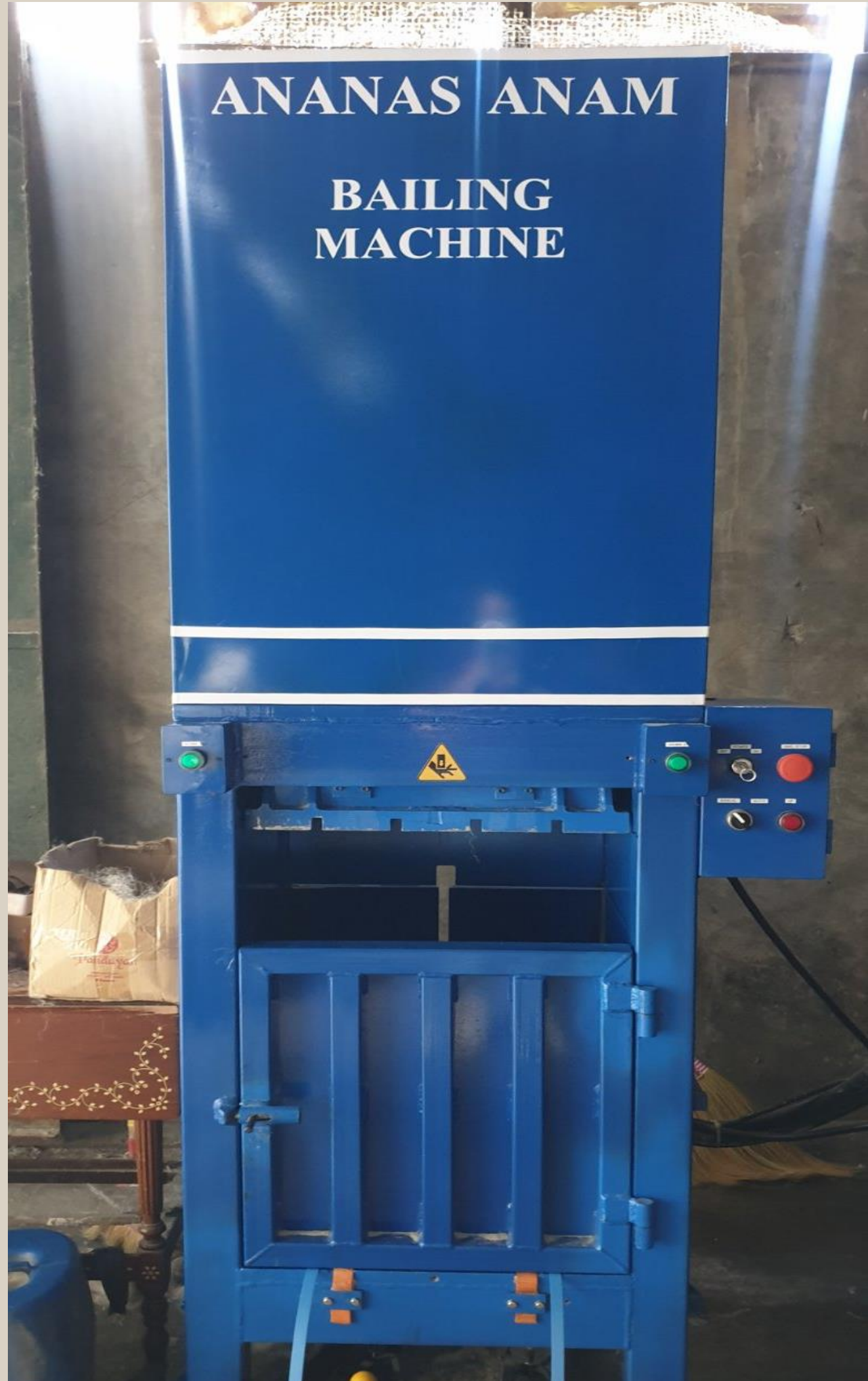
Fiber Baling Machine